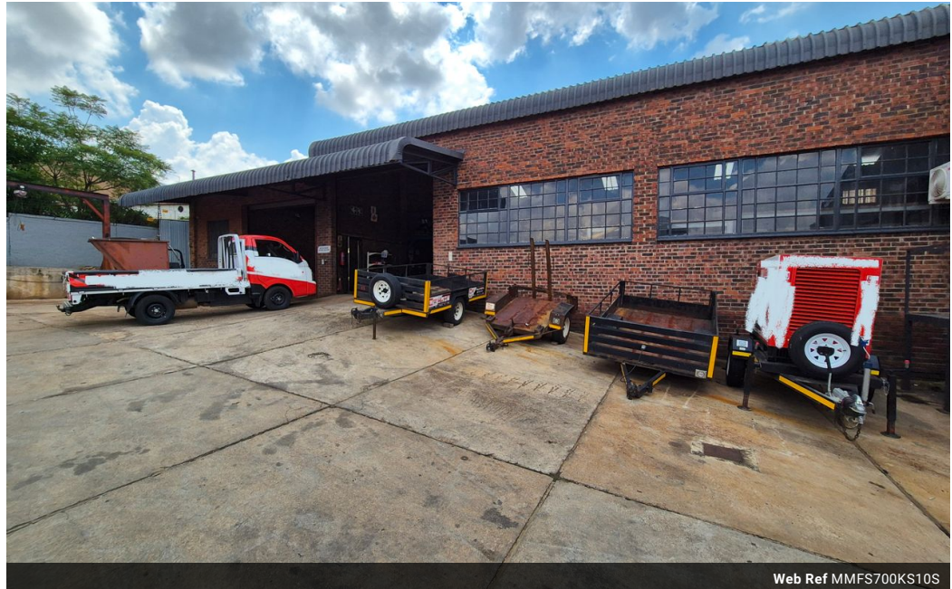
Web Ref MMFS700KS10S

Offers for this listing must be made in R50,000 increments