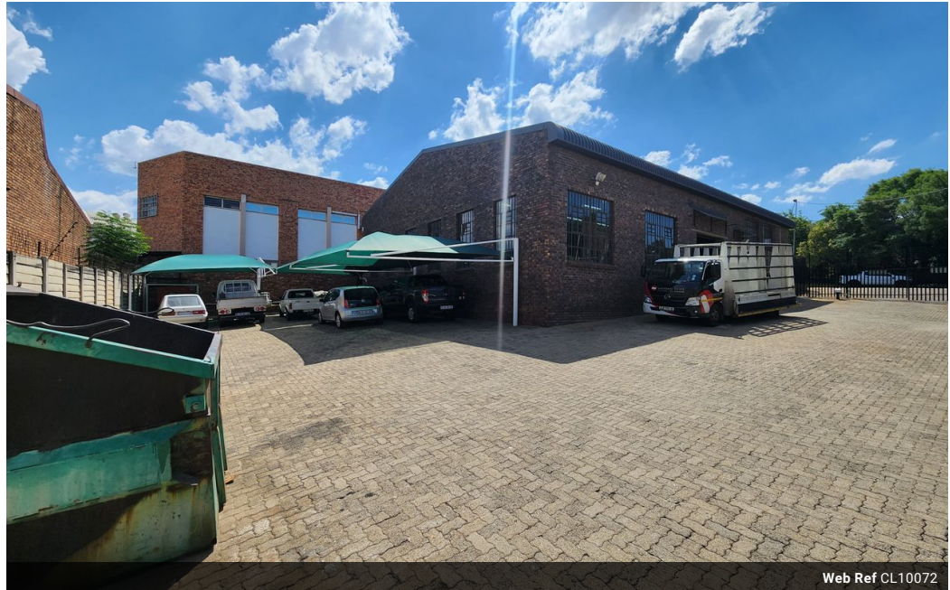
Web Ref CL10072

Offers for this listing must be made in R50,000 increments