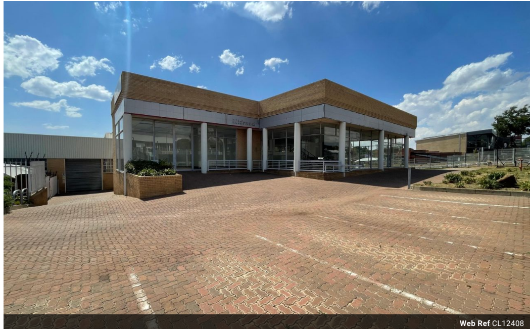
Web Ref CL12408

Office 40A Eden Meadows Complex 1 Van Riebeeck Avenue Greenstone 1609