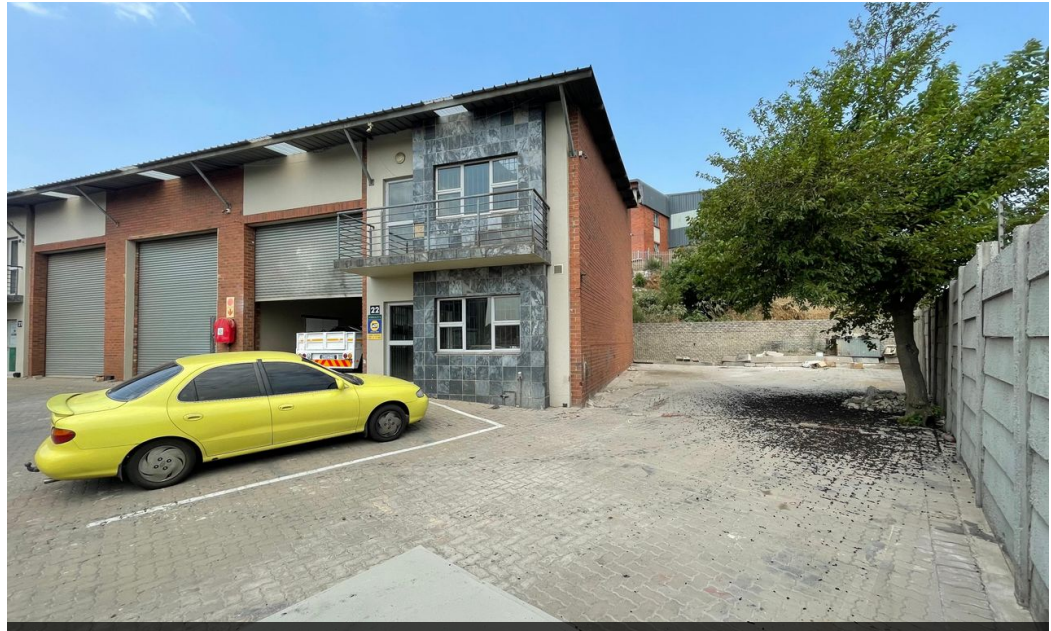
Web Ref WB205CBFS

Office 40A Eden Meadows Complex 1 Van Riebeeck Avenue Greenstone 1609