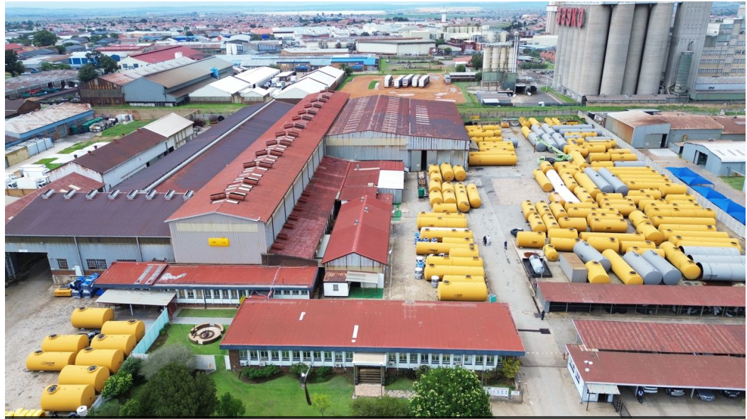
Web Ref RVR9000INFS

Office 40A Eden Meadows Complex 1 Van Riebeeck Avenue Greenstone 1609