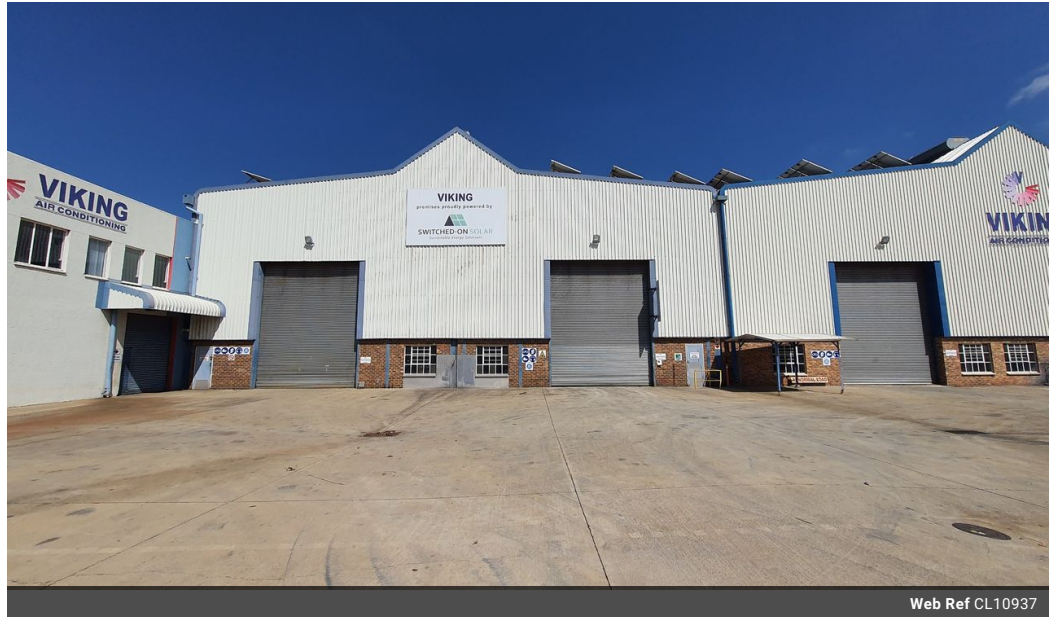
Web Ref CL10937

Office 40A Eden Meadows Complex 1 Van Riebeeck Avenue Greenstone 1609