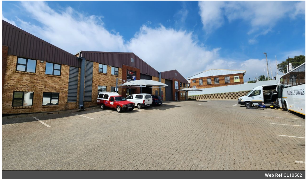
Web Ref CL10562

Office 40A Eden Meadows Complex 1 Van Riebeeck Avenue Greenstone 1609