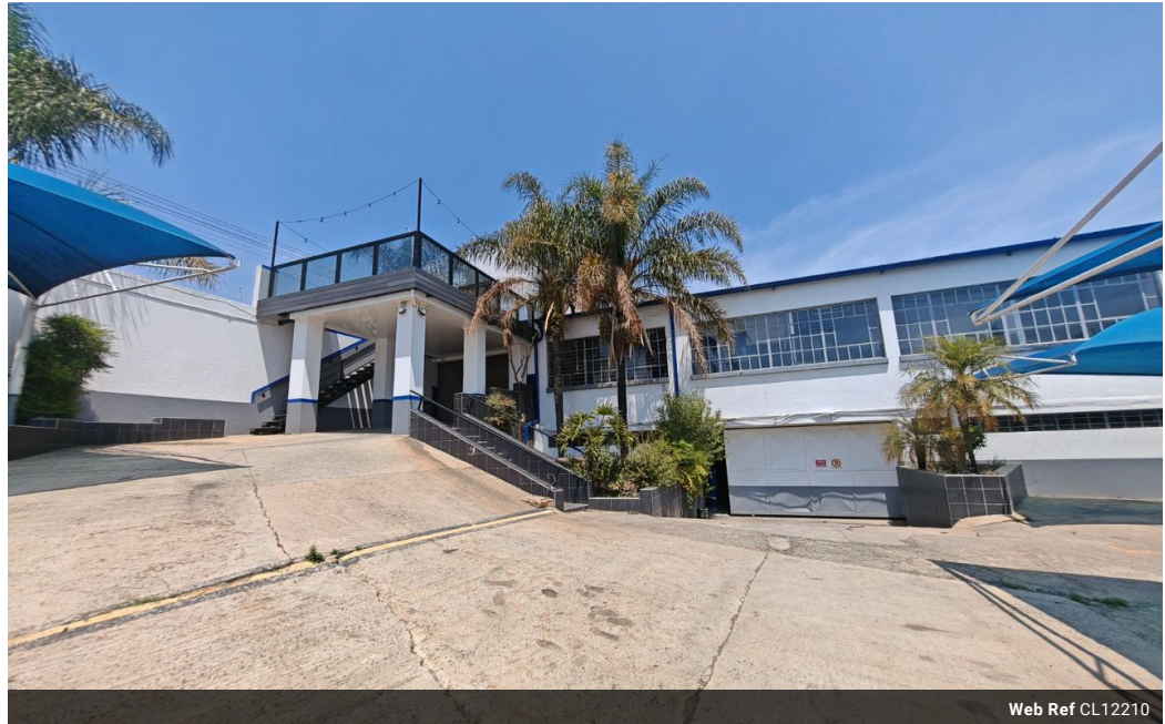
Web Ref CL12210

Office 40A Eden Meadows Complex 1 Van Riebeeck Avenue Greenstone 1609