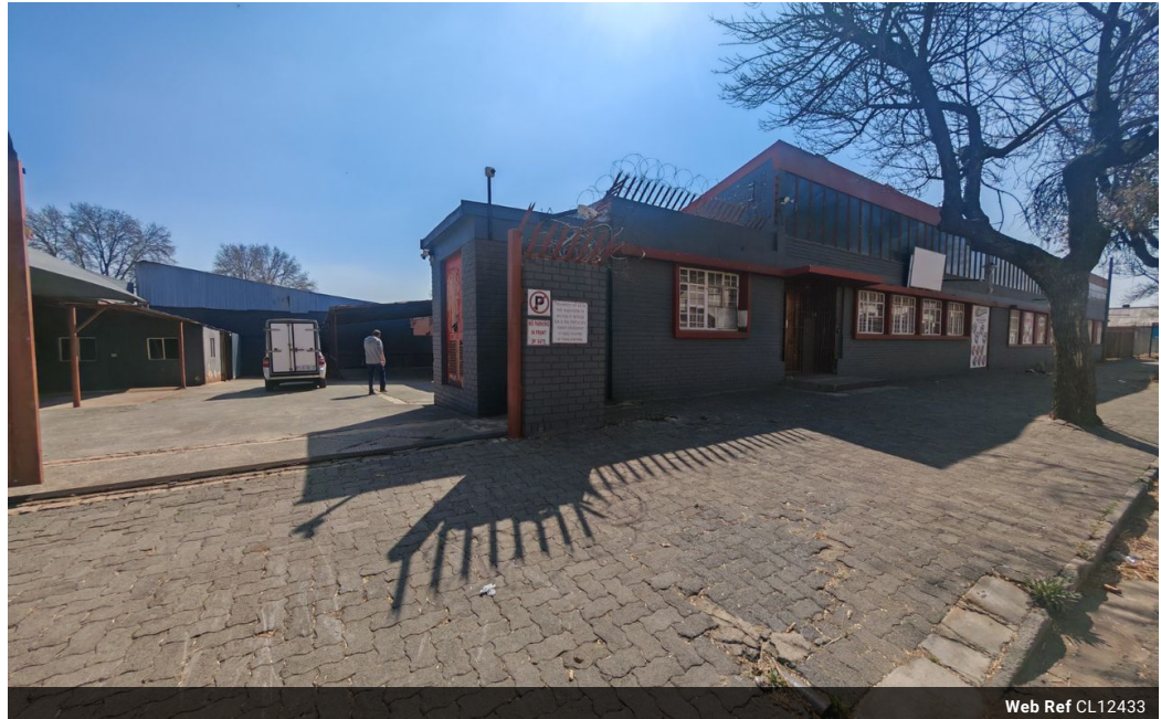
Web Ref CL12433

Office 40A Eden Meadows Complex 1 Van Riebeeck Avenue Greenstone 1609