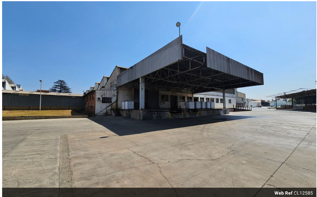
Web Ref CL12585

Office 40A Eden Meadows Complex 1 Van Riebeeck Avenue Greenstone 1609