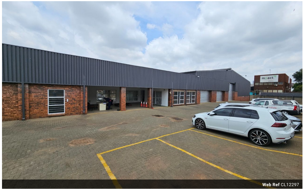
Web Ref CL12297

Office 40A Eden Meadows Complex 1 Van Riebeeck Avenue Greenstone 1609