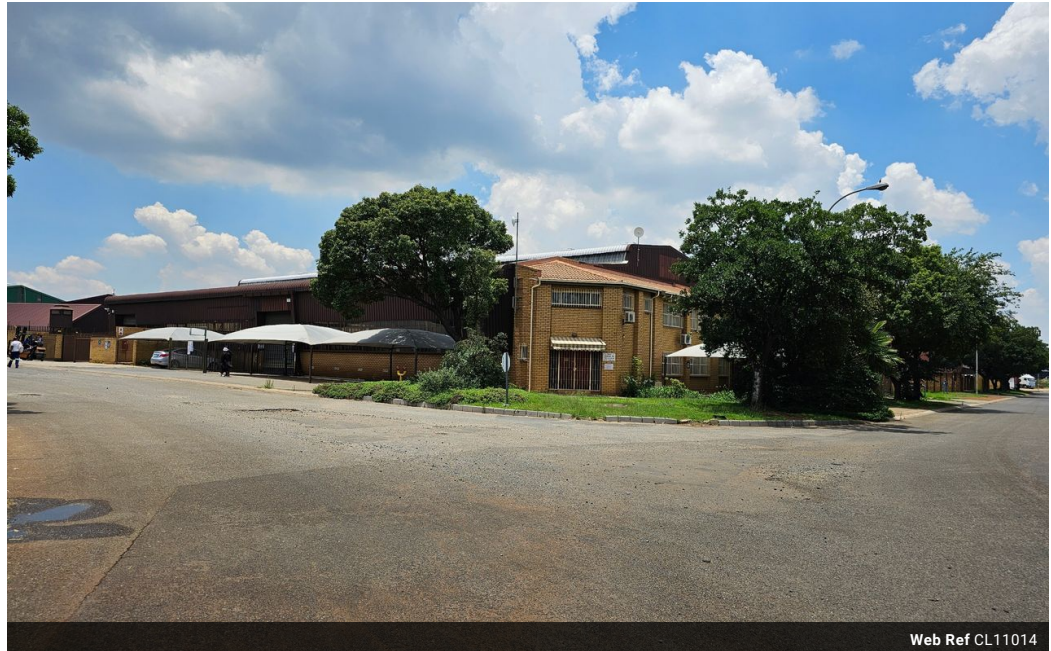
Web Ref CL11014

Office 40A Eden Meadows Complex 1 Van Riebeeck Avenue Greenstone 1609