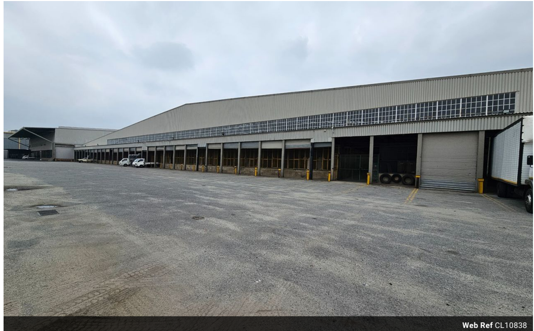
Web Ref CL10838

Office 40A Eden Meadows Complex 1 Van Riebeeck Avenue Greenstone 1609