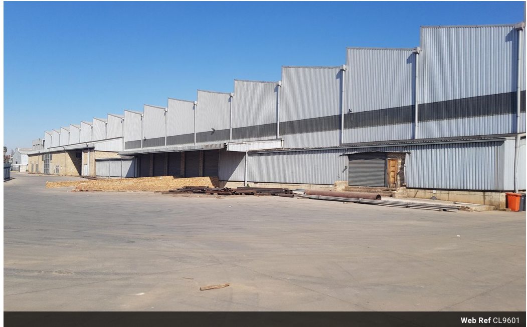
Web Ref CL9601

Office 40A Eden Meadows Complex 1 Van Riebeeck Avenue Greenstone 1609