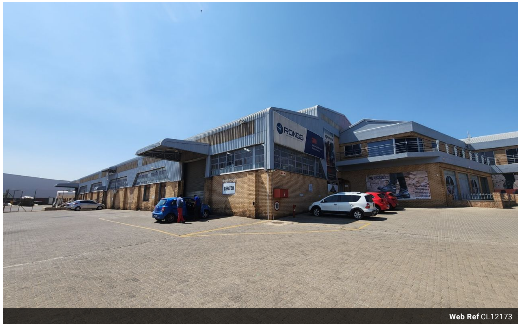
Web Ref CL12173

Offers for this listing must be made in R100,000 increments