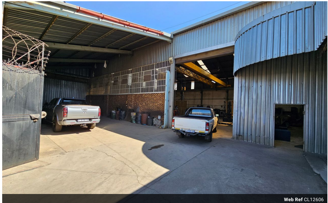
Web Ref CL12606

Office 40A Eden Meadows Complex 1 Van Riebeeck Avenue Greenstone 1609