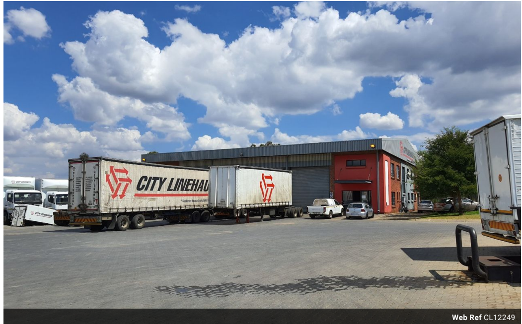
Web Ref CL12249

Office 40A Eden Meadows Complex 1 Van Riebeeck Avenue Greenstone 1609