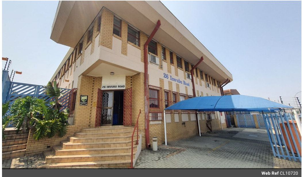
Web Ref CL10720

Office 40A Eden Meadows Complex 1 Van Riebeeck Avenue Greenstone 1609