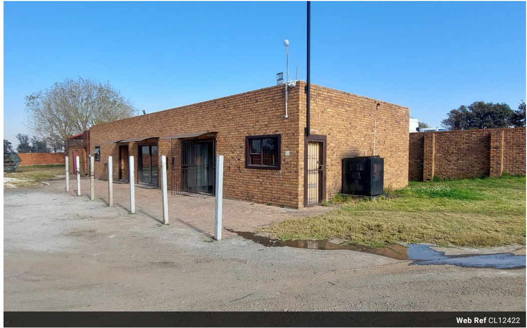
Web Ref CL12422

Office 40A Eden Meadows Complex 1 Van Riebeeck Avenue Greenstone 1609