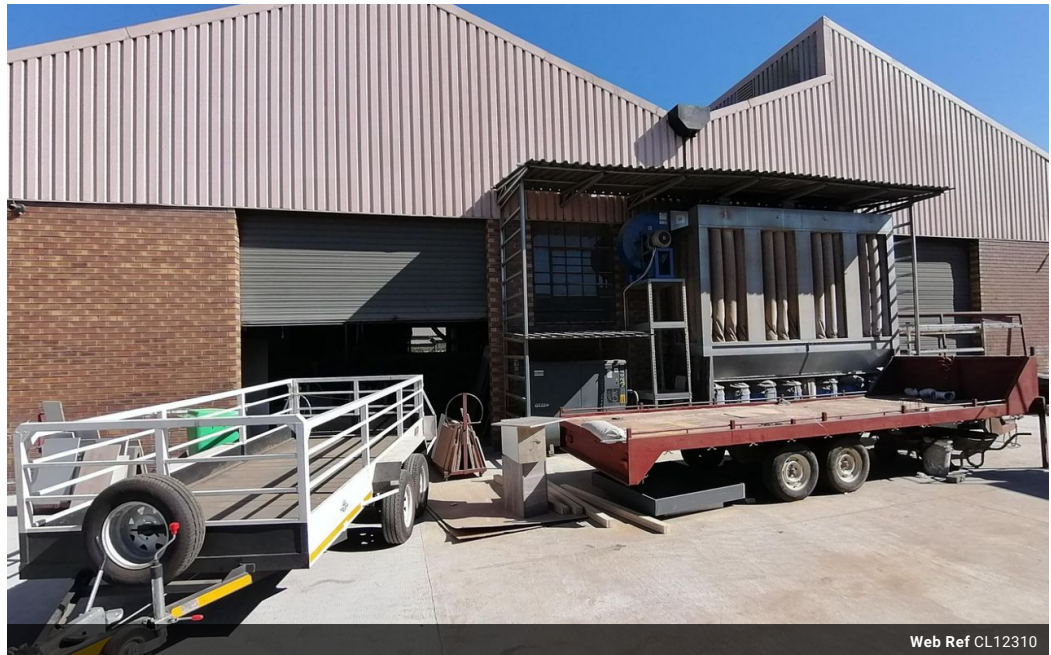
Web Ref CL12310

Office 40A Eden Meadows Complex 1 Van Riebeeck Avenue Greenstone 1609