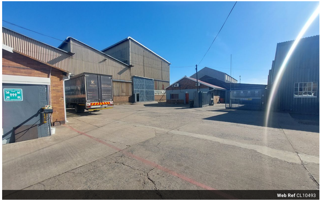
Web Ref CL10493

Office 40A Eden Meadows Complex 1 Van Riebeeck Avenue Greenstone 1609