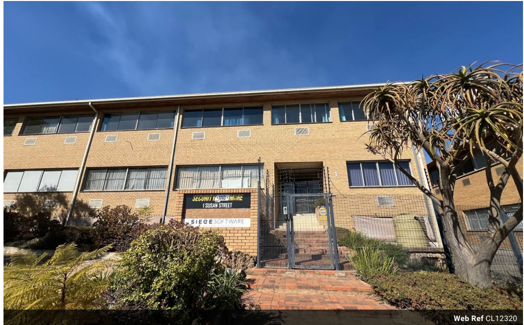
Web Ref CL12320

Office 40A Eden Meadows Complex 1 Van Riebeeck Avenue Greenstone 1609