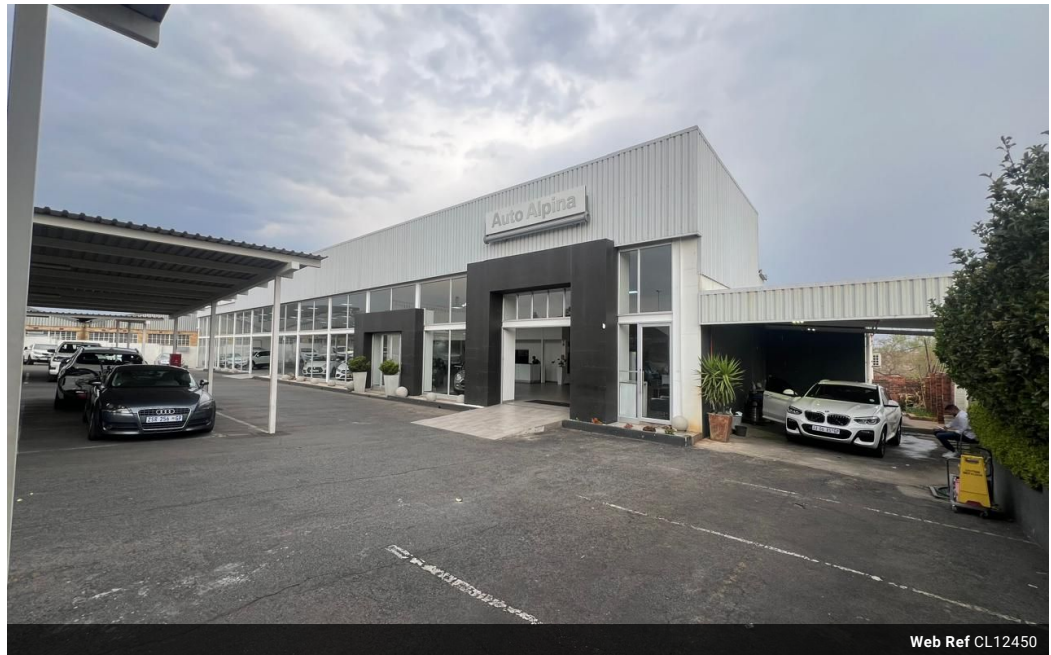
Web Ref CL12450

Office 40A Eden Meadows Complex 1 Van Riebeeck Avenue Greenstone 1609