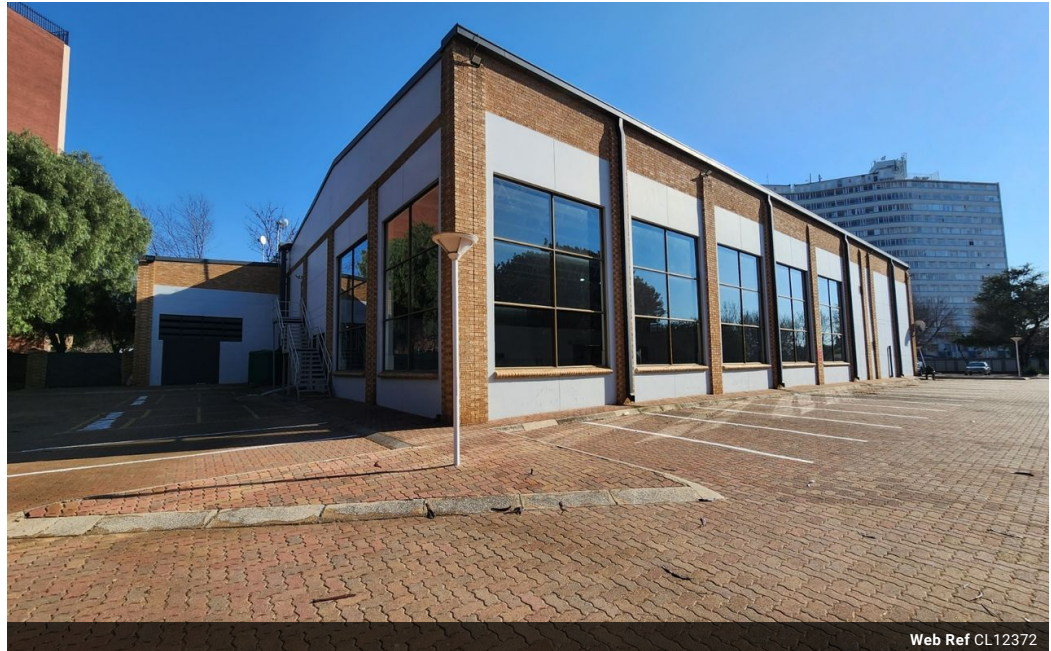
Web Ref CL12372

Office 40A Eden Meadows Complex 1 Van Riebeeck Avenue Greenstone 1609